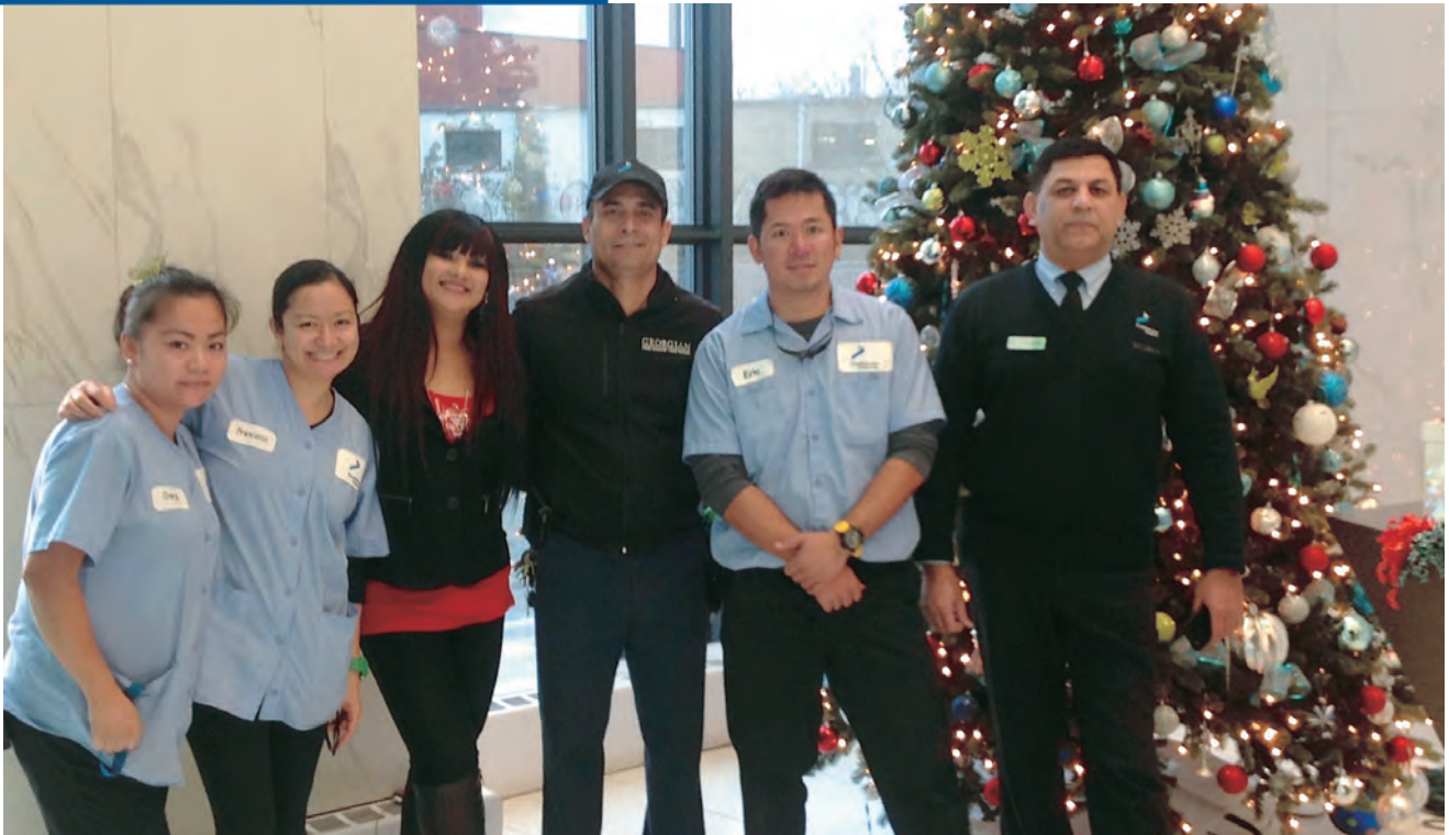
The author is pictured third from left with the engaged team.